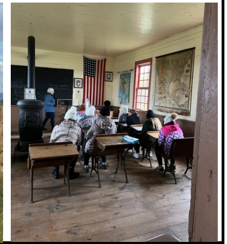
Tuscarora Teachers and Students Show Halloween Spirit